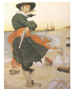
Iranian Ship Captain