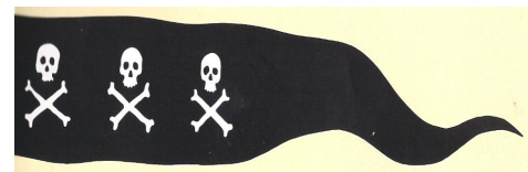
Iranian Naval Flag